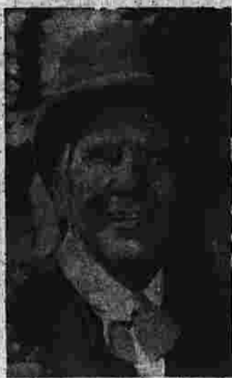
BURGESS MEREDITH appears as Horace Greeley on "Branded" tomorrow night at 8:30 on NBC.

"I was impressed by the serious attack that the creative people took toward the play," said